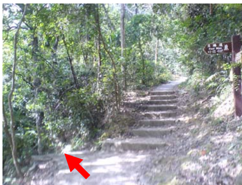
H039 選左邊往貝璐道方向 Take left to Peel Rise