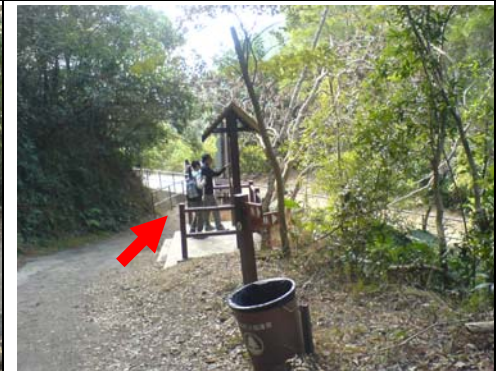
H026 轉右邊 Turn right