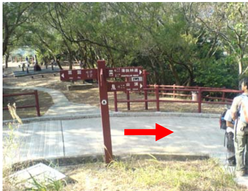
H016 轉右往山頂方向 Turn right to the Peak