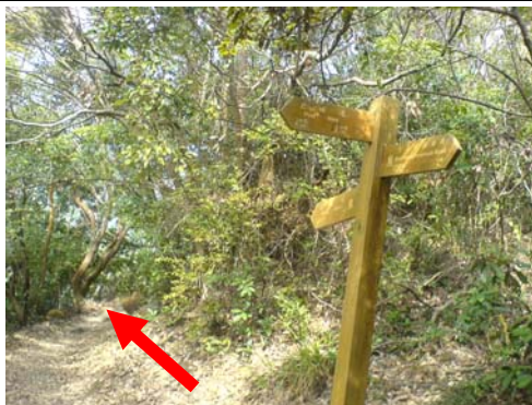
H031 繼續向前往貝璐道 Keep forward to Peel Rise