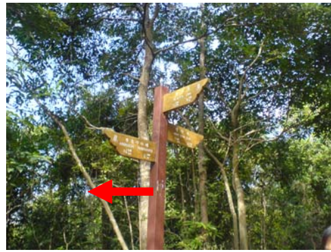
H045 左轉往香港仔水塘 Turn left to Aberdeen Reservoir