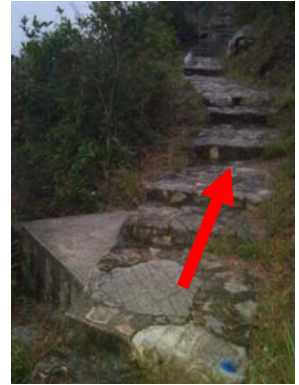
H023 沿右邊往薄扶林水塘 Take right to Pokfulam Reservoir