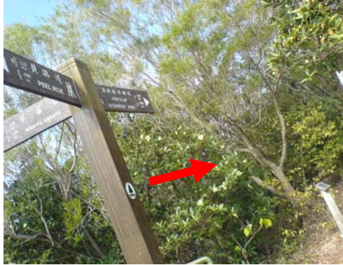
H022 繼續向前往薄扶林水塘 Keep forward to Pokfulam Reservoir