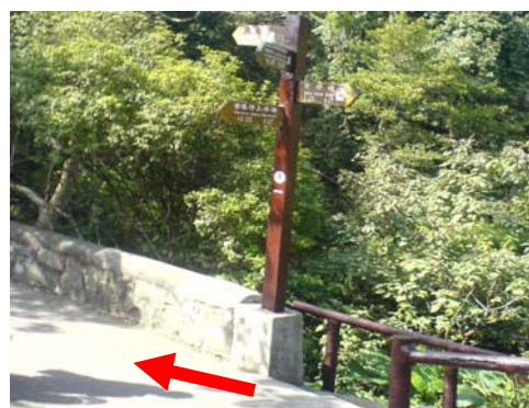
H038 選左邊往貝璐道方向 Take left to Peel Road direction