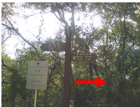
H044 右轉往香港仔水塘 Turn right to Aberdeen Reservoir