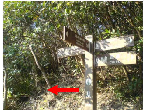
H011 繼續向前經盧吉道往纜車總站 Keep forward to the Peak Station via Lugard Road