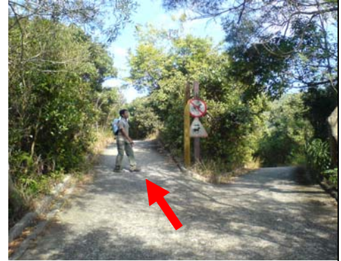
H017 選左邊路 Take left