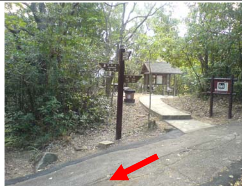
H027 選左邊往香港仔方向 Take left to Aberdeen direction