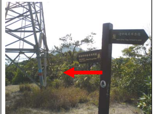
H044 繼續前往香港仔水塘 Keep forward to Aberdeen Reservoir