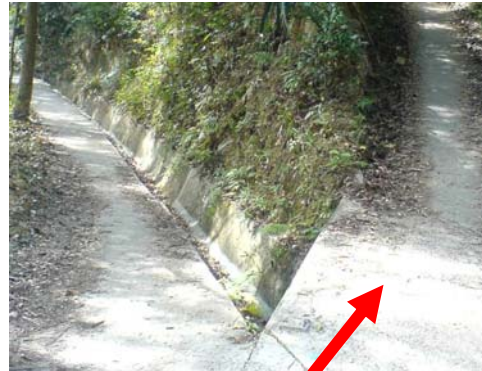
H042 選右邊路 Take right