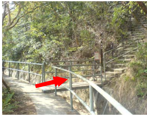
H024 選右邊上樓梯 Take right and up the stair