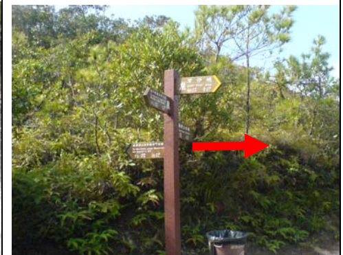
H042 選右邊向灣仔峽方向 Take right to Wan Chai Gap direction