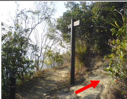
H008 選右上樓梯往山頂 Take right to the Peak

為環保，救地球。此咁可循環再用，請勿隨處棄置。 You can help to save the planet! Please reuse this card.