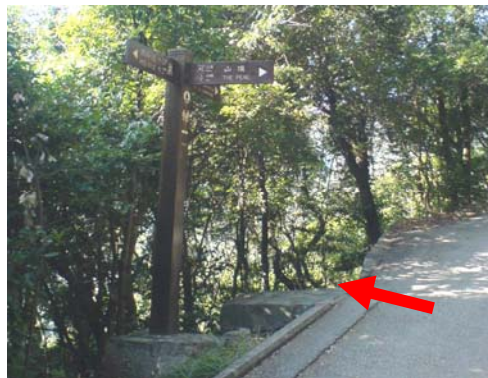
H015 選左邊樓梯入小路 Take left to the footpath