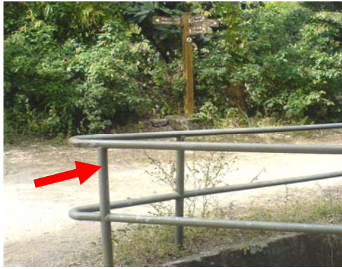
H026 選右邊往薄扶林水塘道 Take right to Pokfulam Reservoir