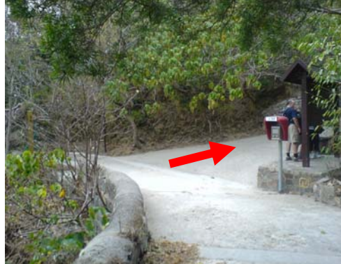
H017 選右上斜路 Take right and go up