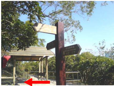
H047 轉左入小路往香港仔水塘 Turn left to footpath and go to Aberdeen Reservoir

The following numbers are the distance post numbers where you have just passed or you are at the scene shows in the picture.