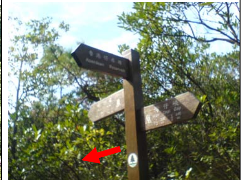
H037 繼續向前往貝璐道方向 Keep forward to Peel Rise